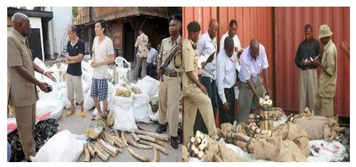
Plate No. 3: Chinese nationals caught in possession of elephant tusks in Dar es Salaam in October, 2013