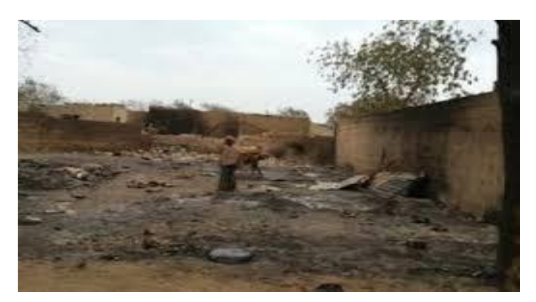
Plate No. 10: Remains of a house burnt by anti poaching agents at Minziro village, Kagera region

LHRC also received reports of incidences where civilians' properties were destroyed or outright stolen by anti-poaching officers. Properties stolen were cattle and cash. Some houses were also reportedly burnt by anti-poaching officers.