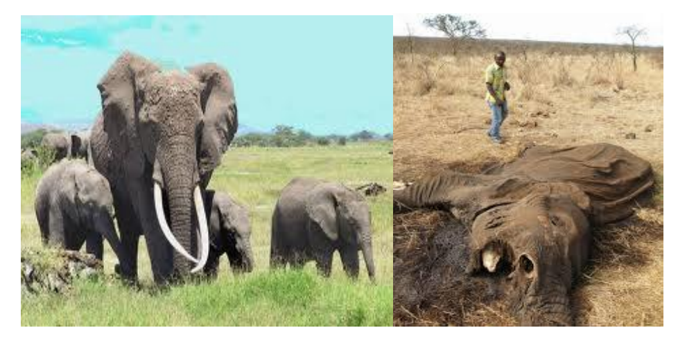
Plate No. 2: Elephants have been mostly targeted by poachers as their tusks are in high demand in the black market

There are two main types of poachers, subsistence poachers and commercial poachers.<sup>9</sup> These poachers are both local and from across Tanzania's borders in the neighbouring countries as well as from outside Africa. For example, there have been reports of poachers from Burundi, who have been caught in possession of elephant tusks and rhino horns.<sup>10</sup> A report by the Elephant Trade Information System (EITS) indicates that some Chinese nationals in Tanzania, whose number has been growing rapidly, frequently engage in illegal ivory trade.<sup>11</sup> A good number of Chinese citizens in the country have been arrested for illegal possession of ivory, including three who were caught in November, 2013, in possession of 706 elephant tusks.