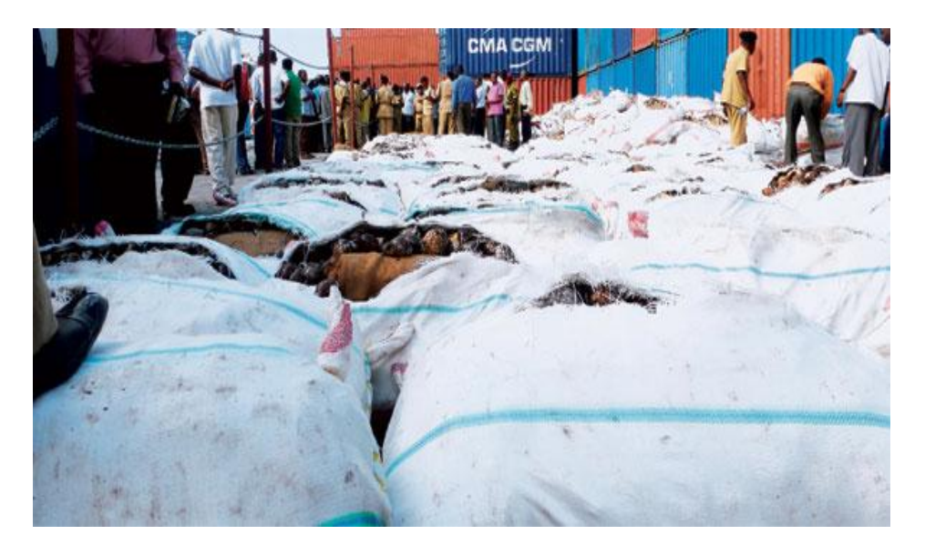
Plate No. 4: Police officers inspecting bags filled with seashells and elephant tusks, seized at Malindi Port in Zanzibar in November, 2013

On October 4, 2013, the former Minister for Tourism and Natural Resources, Khamis Kagasheki said that anti-poaching officers could execute poachers on the spot. He made the controversial statement at the end of the International match for elephants organized by the Tanzania Association of Tour Operators in Arusha, he said:<sup>15</sup>