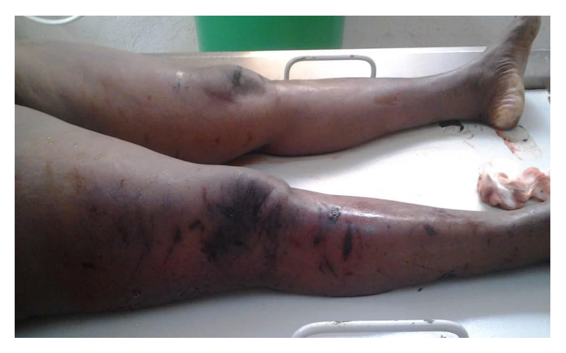
Plate No. 12: The body of the late Emiliana during the second postmortem examination