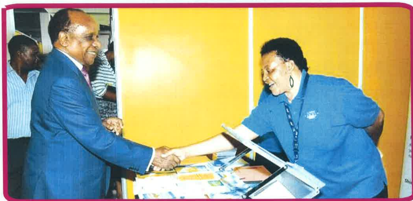
Media Owners Chairperson Dr. Reginald Mengi (L) at the LHRC's Pavillion (file photo)

Among issues discussed during the session were labour rights for journalists, working environment, and challenges facing the media industry in the country. The duo agreed to hold regular briefing sessions to discuss on issues of public interests whenever the need calls for.