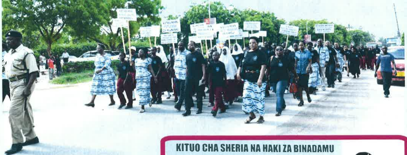
December 10 in pics, with marchers and presentations from the Police Force among others.

The gathering pulled together representatives from human rights associations, envoys accredited to Tanzanians, civil societies, ordinary people, members of the press and ended with performance of traditional dances and music by human rights associations.