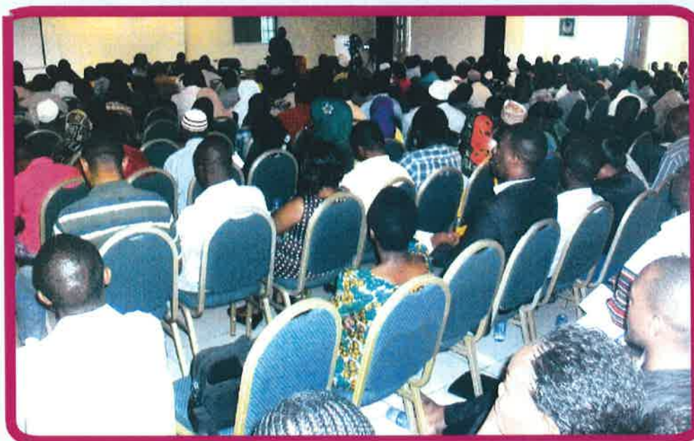
Representatives from CSOs pay attention during the symposium on Constitution matters.

The LHRC in collaboration with 300 other civil societies in the country on November 28th issued a press statement calling upon the need for Tanzania to conduct a public debate over union matters. The historical