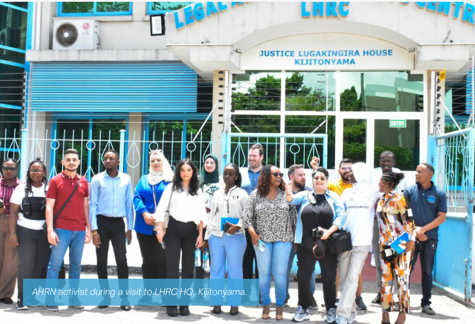
AHRN activist during a visit to LHRC HQ, Kijitonyama.

Delegates from the Stichting Africa Human Rights Network Foundation (AHRN), a pan-African human rights organisation, visited the Legal and Human Rights Centre (LHRC) on February 23, 2024, to exchange views and share experiences on the promotion of human rights in Tanzania and Africa.