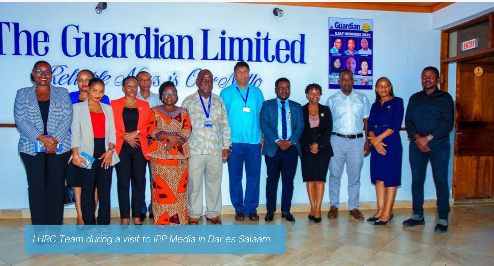
LHRC Team during a visit to IPP Media in Dar es Salaam.

On February 27 - 28 2024, the Legal and Human Rights Centre (LHRC) paid a courtesy visit to IPP Media at Mikocheni Industrial Area and Tanzania Broadcasting Corporation (TBC) offices both in Dar es Salaam. This tour aimed to understand how news and information are reported, focusing on the workings of newsrooms, studios, and production rooms.